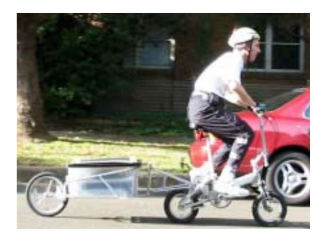
Figure 5: Bernard Weir's mini transport bike with frame mounted Rohloff Hub (Weir)

My knowledge of the Lahar comes through the Australian Human Powered Vehicle community. Schoolteacher Bernard Weir wanted a bike with a wide-range gearing for towing, yet compact enough to carry easily and fit under a desk and on public transport. After researching, Bernard and trike manufacturer Michael Rogan combined to install a Rohloff hub with Lahar mounting brackets in a Velociraptor / Onza mini bike, a combination meeting Bernard's needs (Weir 2002) and an example of mountain biking, non-transport cycling technology influencing and becoming transport cycling technology.