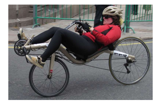
Figure 12: Lowracer cycles showing the angle of the feet to the ground

Heel clearance on front wheel drive in-hub gearbox bikes and trikes depends on the front wheel size, the pedal radius, and the distance the feet reach below the pedals. The seat angle from the pedals and other factors influence the angle of the feet when they are closest to the ground. A large 700C wheel has a 350mm radius and with 170mm pedals there is only 180mm left to be taken up by underhanging shoes and ground clearance. However as shown below on lowracers, the feet can be a long way from vertical when the heels are closest to the ground.