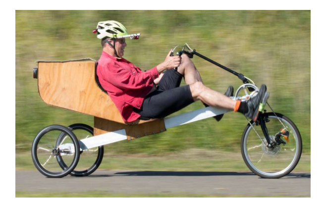
Figure 13: Author's front wheel drive trike and the bike path slope angle where wheel slip starts.

Front wheel drive bikes may have problems climbing hills due to wheel slip. For example, wheel slip means my chain driven front wheel drive cycle can't climb long hills with more than 10 degrees slope, see pictures below.