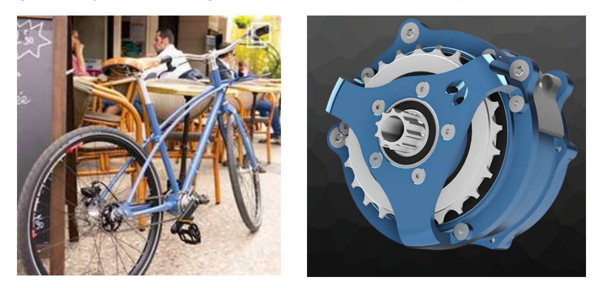
Figure 11: Bicycle with Kervelo gearbox, Kervelo Gearbox