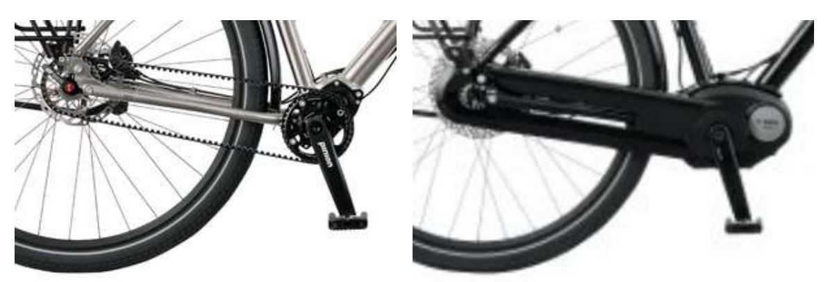
Figure 6: Pinion gearbox with belt drive, Bosch electric assist with Rohloff hub (<u>www.idworx-bikes.de</u>)

Pinions require special frames, but these types of frames are becoming accepted through the socio-technical frame of ebikes. Electric assist units from Bosch and Shimano have Pinion-like mounting arrangements, so it is possible suppliers making some types of ebikes could consider adapting frames to suit Pinion gearboxes a small step. Several bike reviews (cyclingabout 2018, dirtmag 2017) point out that Pinion gearboxes resemble electric motors.