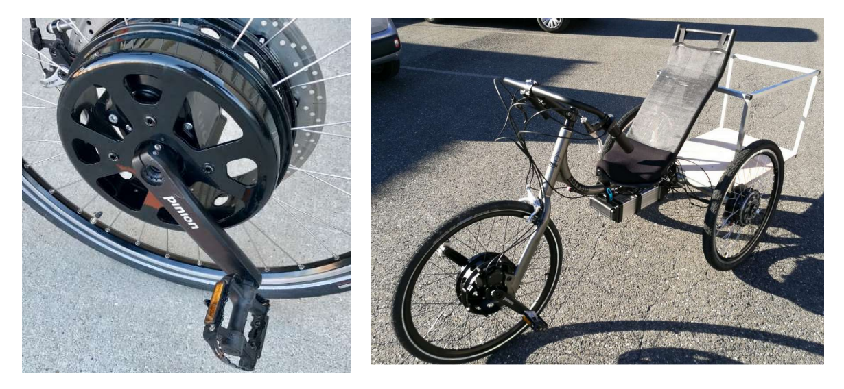
Figure 10: Kervelo adaptation of Pinion Gearbox and E-assist trike .

In 2018 Kervelo introduced in-house-built planetary gearboxes with up to 12 gears and a 545% ratio for mounting in front hubs of recumbents and frames of bicycles. Kervelo plan to introduce integrated electric assist for their frame-mounted bicycle gearboxes. Their developments have taken place in parallel, designing fit-for-purpose gearboxes, and simultaneously selling and testing reactions to front wheel drive cycles.