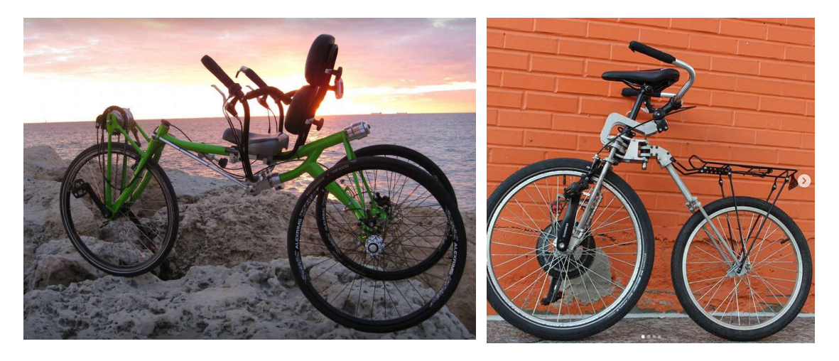
Figure 9: Trivek and Bellcycles front wheel drive cycles

Others including Jeremy Garnet and Marc Le Borgne and have taken up the challenge of producing effective cycles without a chain by developing mechanical gearboxes, and MC2 are producing modular (Fig. 7) versions of