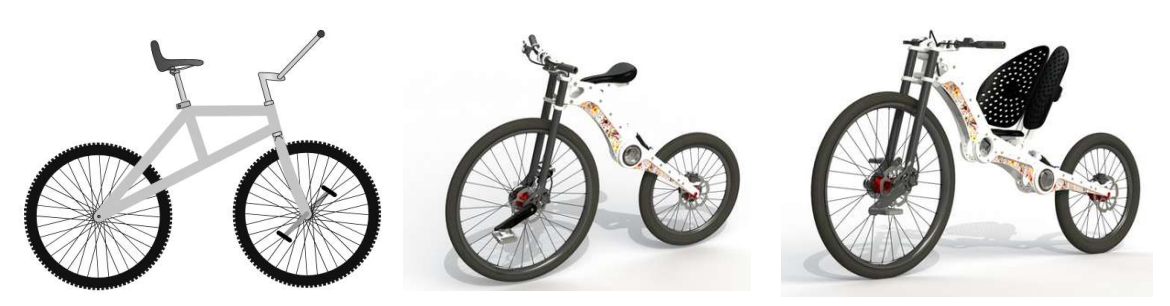
Figure 8: In-hub front wheel drive concepts by Stegmann and Vittouris (Stegmann, Vittouris)

Figure 7: Kretschmer "Funbike", MC2 Evobike assembly options (Kretschmer 1999a, MC2 Website)