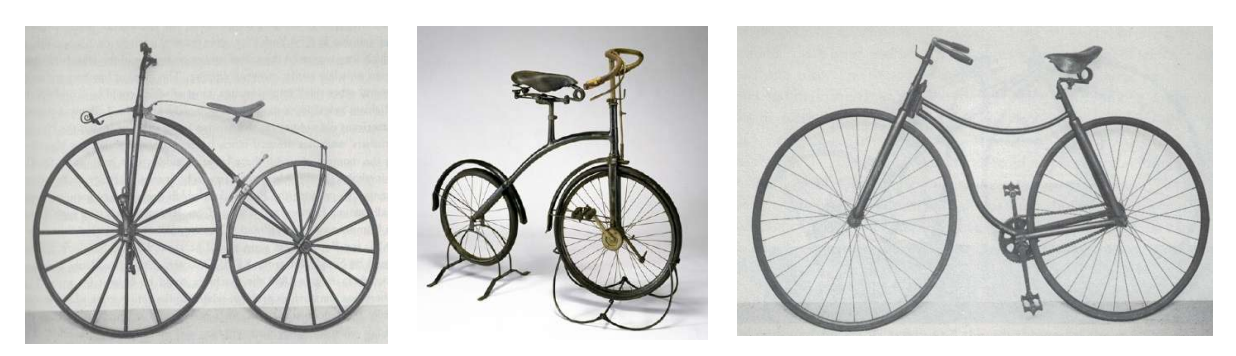
Figure 2: Michaux 1865, Bantam 1891 front wheel drive cycles, Rover 1894 bicycle, (Bijker, Garnet)

This paper does not provide more history of front wheel drive and gearbox cycles because of excellent coverage in Bijker and online in Garnet (2018). Instead, this story samples recent developments beginning with the Rohloff Speedhub, through Thomas Kretschmer's designs and other concept bikes leading to today's commercial front drive gearbox hub cycles.