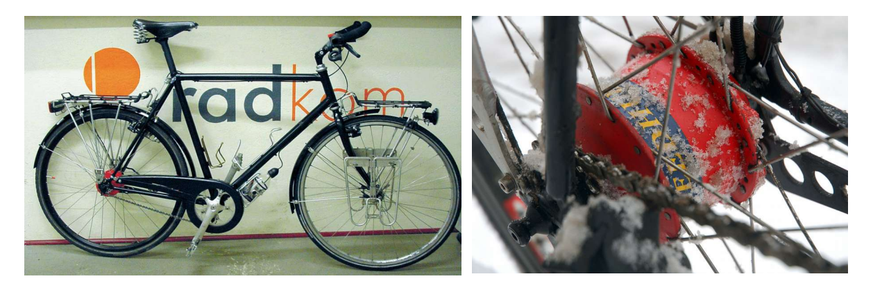
Figure 3: Rohloff Hub Touring Bicycle, Rohloff Hub in icy conditions

The Rohloff Speedhub was developed in 1998 by Rohloff AG, a German company. For the first time, it provided cyclists requiring a wide range of gearing (see Appendix 1) with a fully-sealed alternative to derailleur gearing. Despite costing USD 1500 in 2009 (Berto 2012, p. 350), it was readily accepted for trekking bikes, recumbent trikes and mountain biking. Compared to bikes with twin derailleur gearing, a Rohloff-equipped bike is less prone to handling damage and chain wear, and because it is operated by a single control, gears are selected more easily. Because the Rohloff hub wheel does not need multiple sprockets, it can be used with maintenance-free belt drives and its spokes can be spaced widely and symmetrically on the hub, increasing spoke triangulation and wheel strength (Wilson 2004, p. 329).