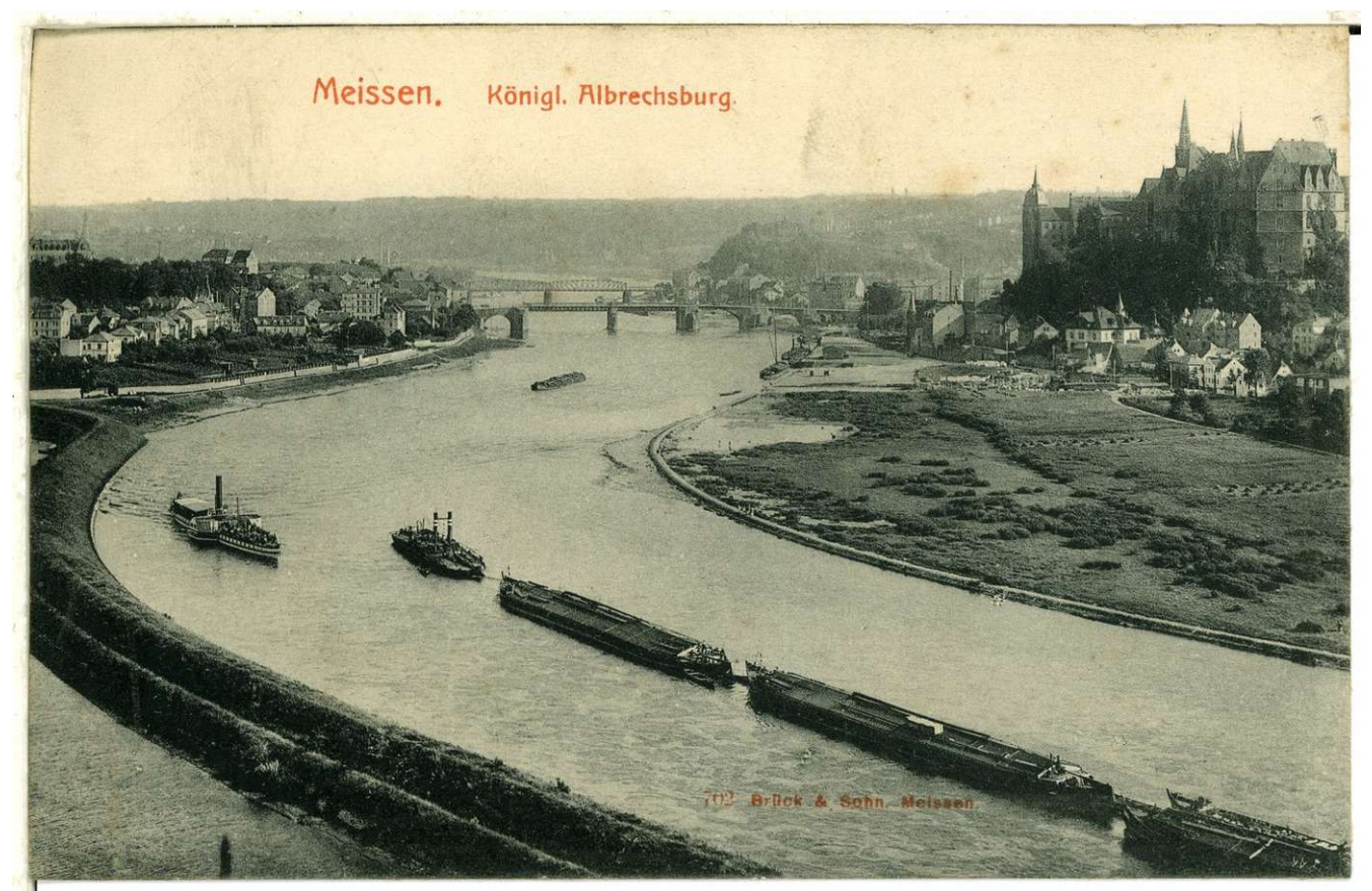
Postcard of a chain tug and barges on the river Elbe

Chain ferries belong to the category of <u>cable ferry</u>. Mostly the cables used are wire ropes rather than chains and where feasible the ferries utilize the water current as motive power - they are then called <u>reaction ferries</u>. This involves the use of long ropes suspended over a river, stretched near the surface, or supported by buoys. However it is also possible to use heavy cables which are not stretched but normally lie loosely at the bottom of the body of water, thus invisible and not impeding shipping. In this mode of operation, chains are particularly suitable, as they are very flexible and easy to grip without slipping – by hand or with <u>chain sprockets</u>. In operation, the ferry pulls itself along one or two ropes or chains, or sometimes using one chain for pulling and one rope for extra guidance. Chain ferries are used as crossings, but the technology was also used in the 19th and 20th centuries over long distances in the longitudinal direction of a river run, especially in France and Germany. These highly developed <u>chain boats</u> pulled strings of barges over hundreds of kilometers, much more efficiently than today's shipping. A <u>chain tug is still in operation</u> through the 6km long canal tunnel Riqueval near Saint Quentin in France.