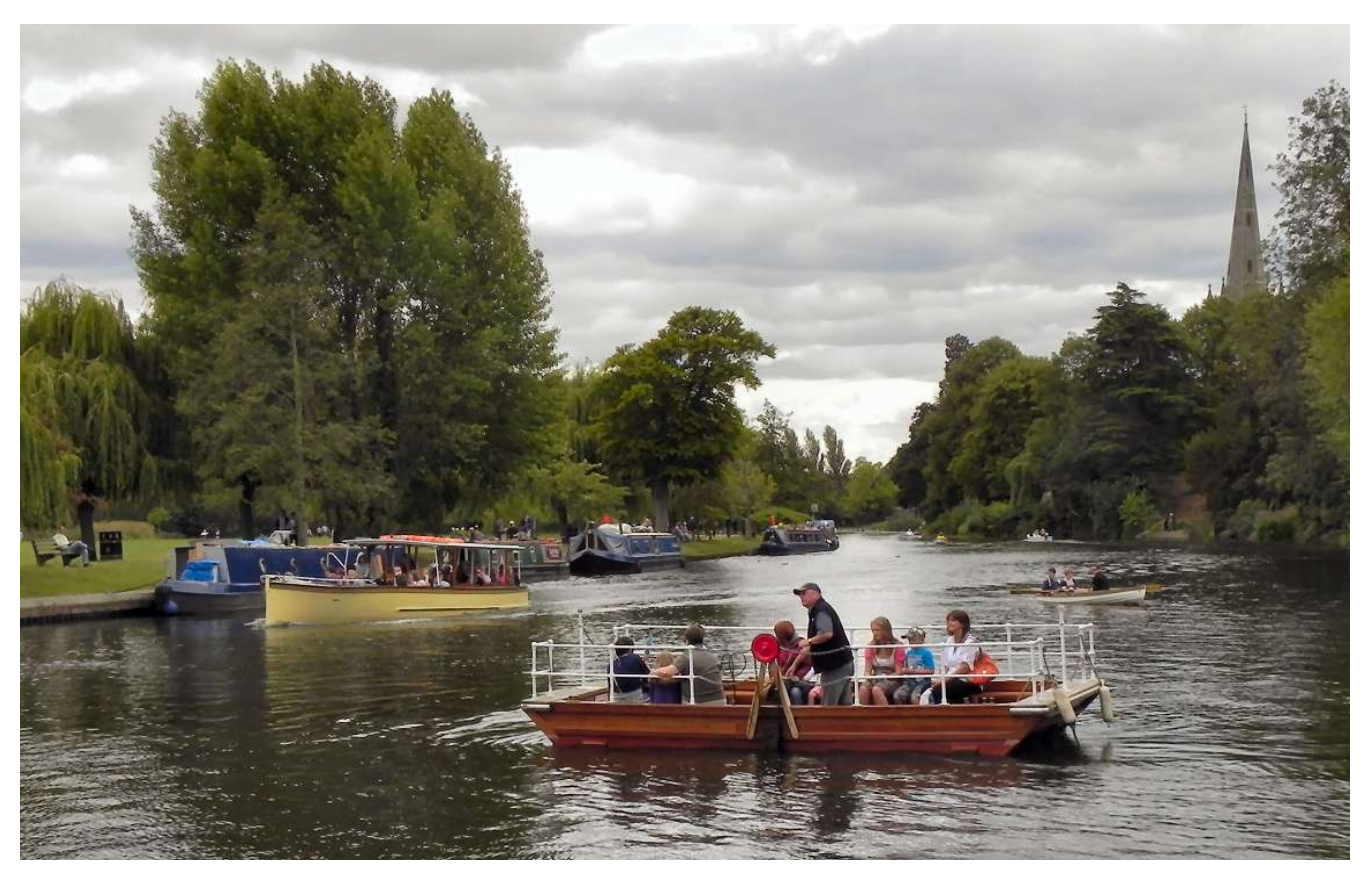
The chain ferry over the river Avon (GB) is cranked by hand on one side. It is sufficiently slow for the boat on the left to pass safely.