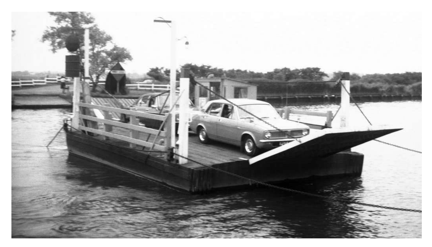
The <u>Reedham Ferry</u> in Norfolk GB is typical for many river crossings in England and Germany. Before 1950 (photo) it was cranked by hand over the approximately 45m wide river Yare. Today it has a motor on one of the chains. See also <u>here</u> and <u>further historic photos</u>.